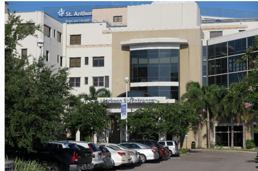
Jackson Street Entrance