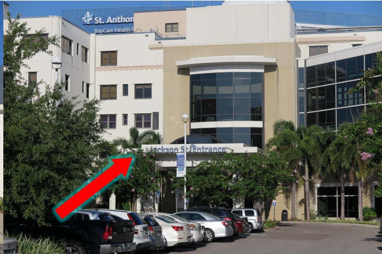
Jackson Street Entrance